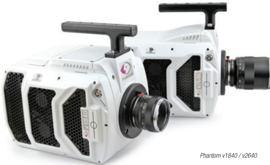
Phantom v1840 / v2640

For the most current version visit www.phantomhighspeed.com Subject to change Rev May 2018