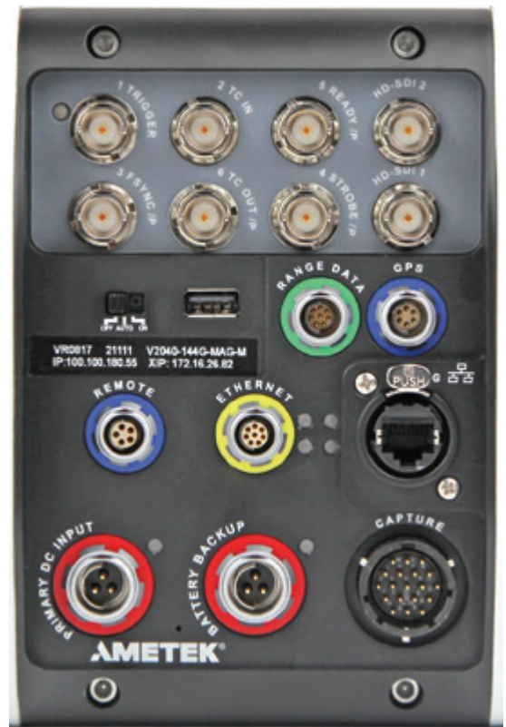
Phantom v1840 and v2640 - Back Panel

Image-Based Auto-Trigger PIV features Multi-Cine Burst Mode Continuous Recording Internal Mechanical Shutter SYNC-to-Trigger Quiet Fans