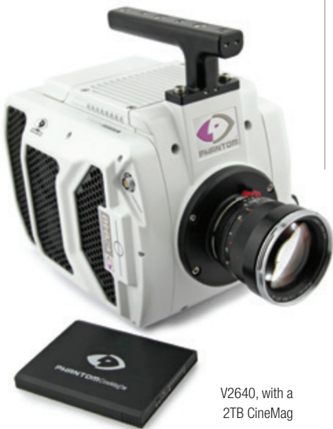
V2640, with a 2TB CineMag

Converting between 4Mpx and 1Mpx capabilities greatly expands the cameras' usefulness. Switch to the 4Mpx when the application requires significant detail, then switch to a 1Mpx when increased frame rate is needed.