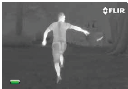
Assailant trying to dispose of evidence

No matter how clever a suspect may be, they can't hide their heat. Rather than rush on the scene with a flashlight that instantly gives away your position and only illuminates your immediate area, FLIR LS is just as portable, and exponentially more effective. Search the scene for discarded evidence in pitch black conditions where traditional night vision fails. You can see through smoke, dust and light fog. Even light foliage and camouflage are powerless against thermal imaging. Take away every hiding spot with FLIR LS Series.